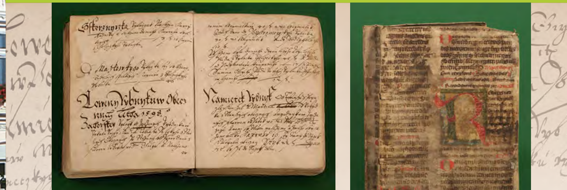
Registers of fish seeds, fish harvests and fish sales from the town Vodňany fishponds, 1589 – 1615