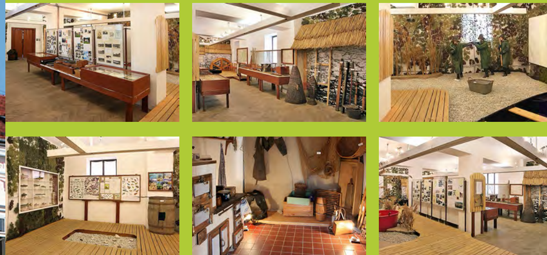
Long-term exhibiton at the ground floor of the former synagogue

2014 the exhibition named „The art of restoration“ to the 110 th anniversary of establishing the museum in Vodňany took place in the gallery.